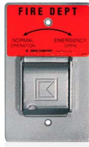
Knox Gate & Key Switch (Single Lock on Plate)