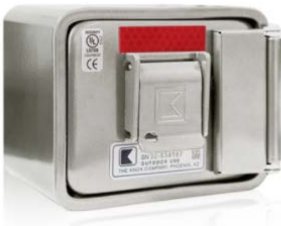
KnoxBox 3200 - Surface Mount