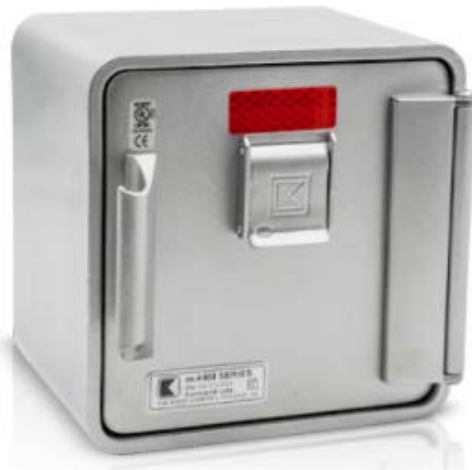
KnoxVault 4400 – Surface Mount