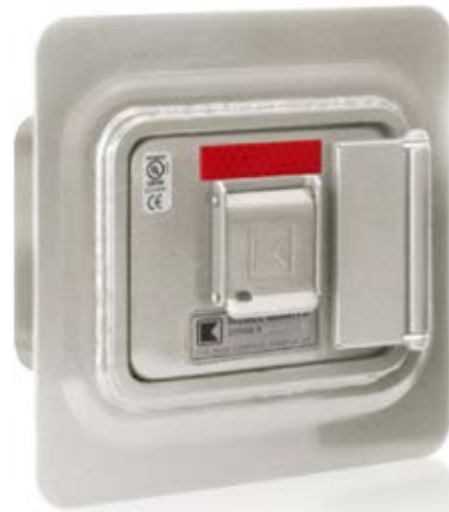
KnoxBox 3200 - Recessed Mount