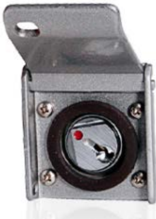
Knox Gate & Key Switch (Lock w/ Dust Cover)