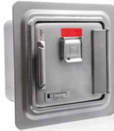
KnoxVault 4400 – Recessed Mount